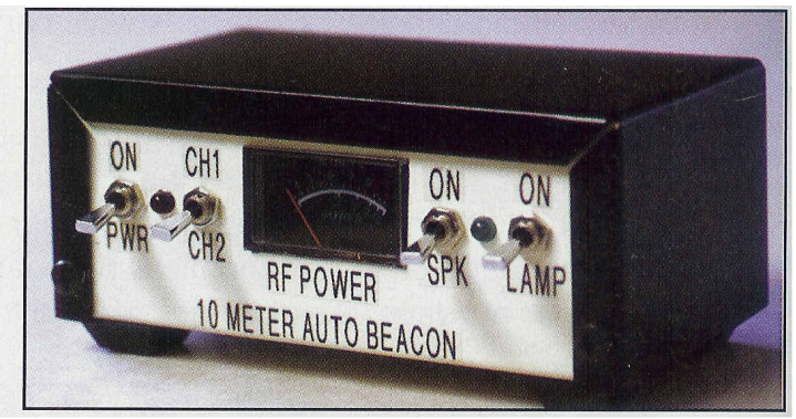
Photo A- Front view of the beacon transmitter. A label machine gives everything a professional, finished look.

This project features a control interface that will store the CW message and key the transmitter automatically at intervals you determine. I love bells and whistles. Therefore, for the front of the beacon unit (photo A), I incorporated an RF meter and four switches, one to turn the system on and off, another to change between two different frequencies (in case one is busy or taken), a third to turn the monitor speaker on and off (who wants to hear that 24 hours a day?), and the fourth to turn on a light for illuminating the meter. I needed the last item to save power in case of portable use.