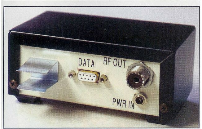
Photo B- Rear view of the beacon transmitter. The 9-volt battery clip permits portable operation. The DB-9 data port is for hooking up a computer to program your call sign and other options.

This kit is available for $30 plus shipping from <http://www.expandedspectrumsystems.com>. The reason I went with this interface over others is the easy ability to program it from a DB9 connector, as well as the included LEO feature for the visual display I wanted. It is a very-high-quality interface that goes together easily and can be completed in just a few hours (see photo C).