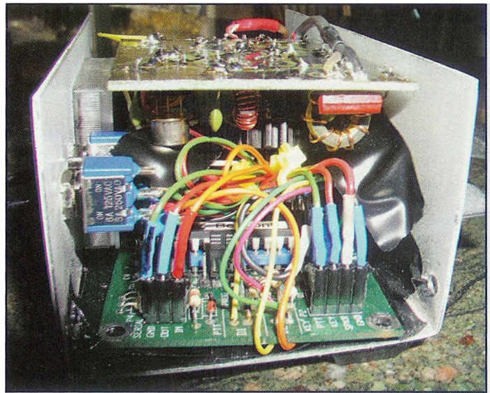
Photo E- Interior view of the completed beacon transmitter and controller. The transmitter board is installed upside down on top of the controller circuitry due to space constraints (be sure to put electrical tape along the inside of the cover so you don't short out the transmitter). If you don't mind a bigger box, you can mount the two boards side by side or however you'd prefer.

Standalone 10-meter CW kits are next to impossible to find. It seems as if you can find 20, 40, and 80 meter ones all day long, but good luck finding a 10-meter one. After searching and searching I finally located a transmitter kit called "the little Joe," available for around $25 from <a href="http://www.danssmallparts.com">http://www.danssmallparts.com</a> and shown in photo D. Again, this can be built in just a few hours. You will need to specify the 10-meter version.